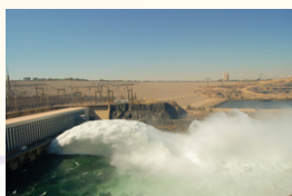
The Aswan High Dam