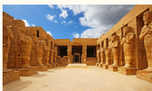
Temple of Karnak