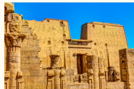
Temple of Horus

Most of the best preserved sites of ancient Egypt are found in the desert where there is almost no rain.