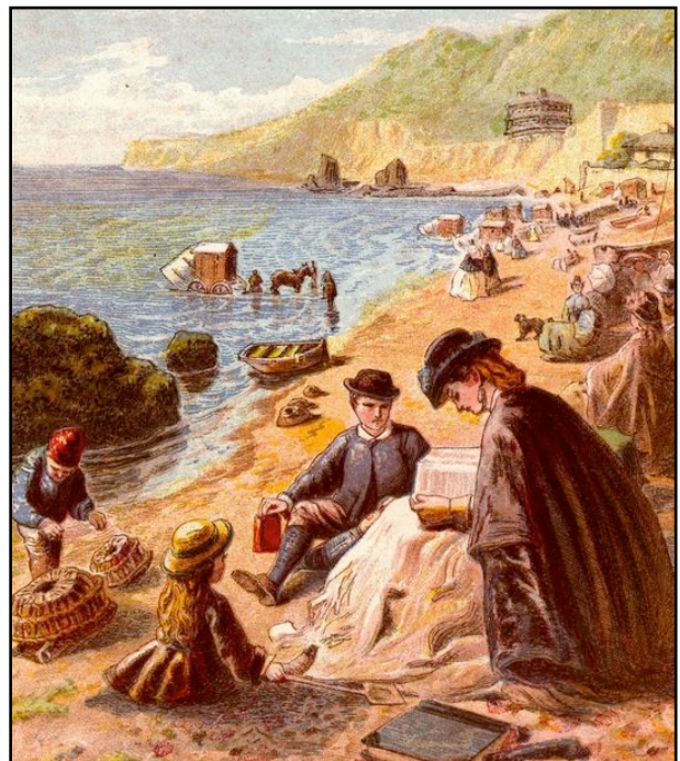
A Victorian family at the seaside

During this time, lots of new factories and machines were being built in the cities which meant the cities became crowded and dirty. Lots of people who lived in towns and cities got ill because of the pollution and diseases that were spread. Going to the seaside was a good way of getting away from the busy towns to breathe the fresh, clean air and enjoy the sea and the sand.