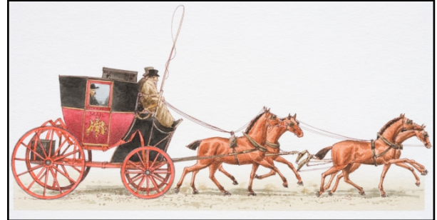
A horse and carriage for a rich family

Going to the seaside used to be something that only rich people could do. They could travel in their expensive carriage and spend a few weeks or even a few months by the sea. Poorer people couldn't do this as they couldn't afford the trip or take the time away from their work as travelling by carriage took a long time.