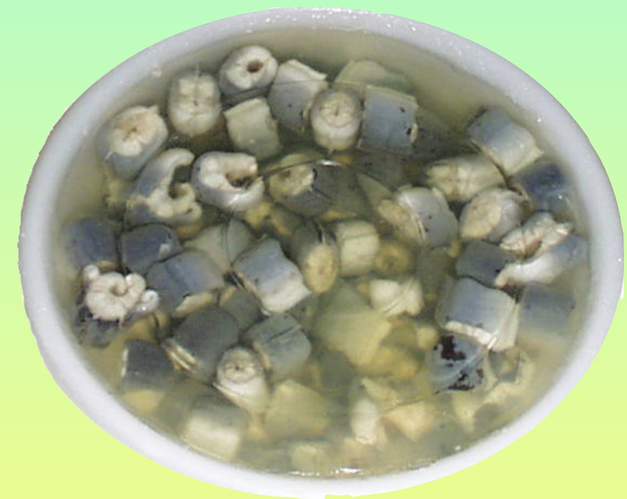
Jellied eels...a tasty seaside snack!

A very fashionable thing to do was take a walk along the promenade. People stopped on the way to see the entertainment and to eat food that they could carry with them, such as fish and chips, ice-cream, cockles and jellied eels.