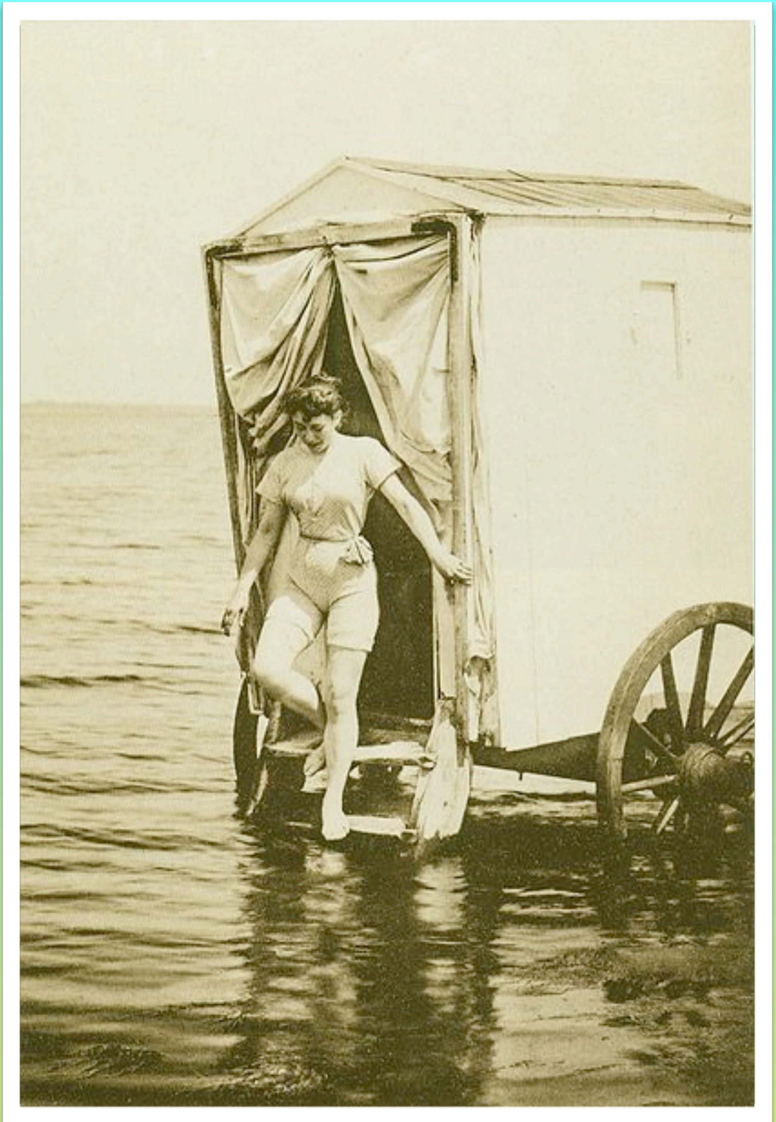
A woman stepping out of a bathing machine in her swimming costume.

For this reason, people didn't wear swimming costumes like we have today but ones that covered much more of their bodies. Bathing machines were little huts that could be rolled into the water. Women (and sometimes men) would get changed in the bathing machine and then step into the water without anyone having to see them in their swimming costume.