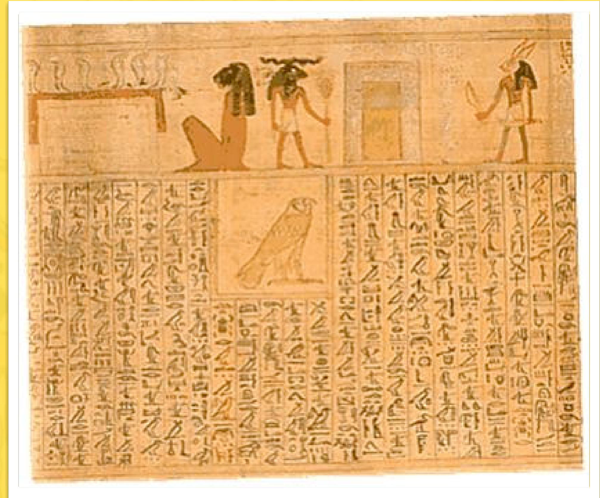
Examples of ancient Egyptian papyri