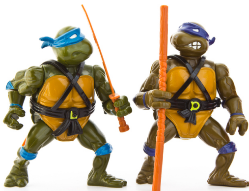
Teenage Mutant Ninja Turtles