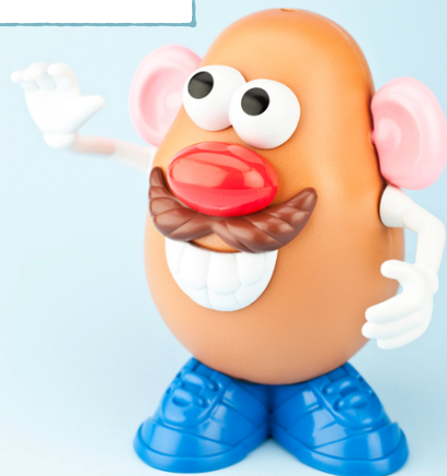
Mr Potato Head