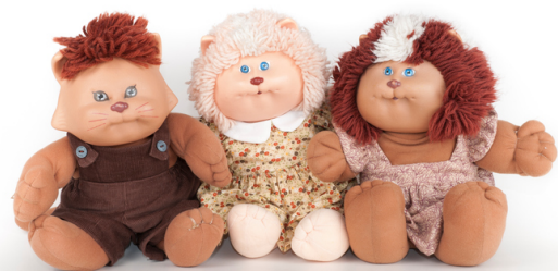
Cabbage Patch dolls