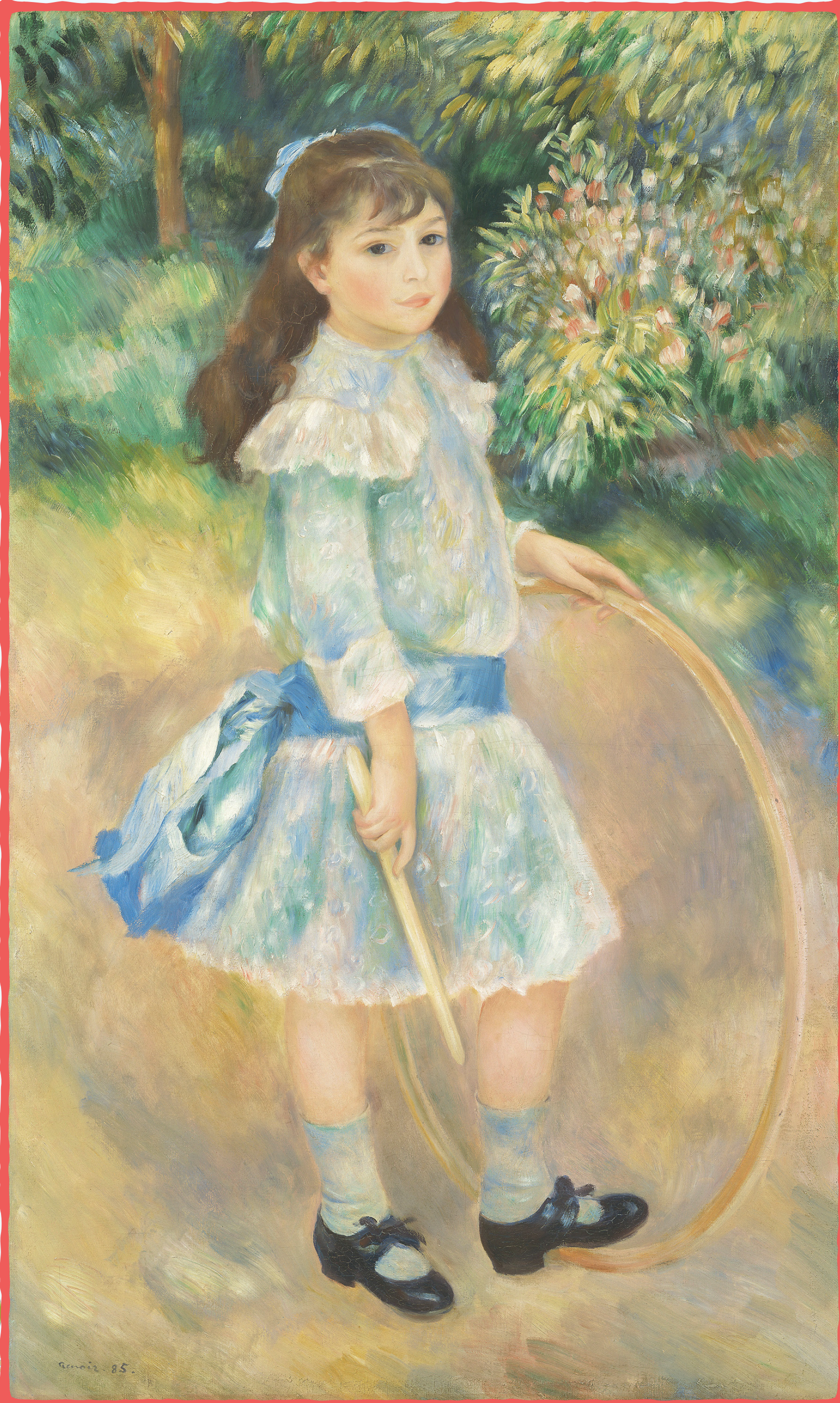
Girl with Hoop by Pierre-Auguste Renoir 1885