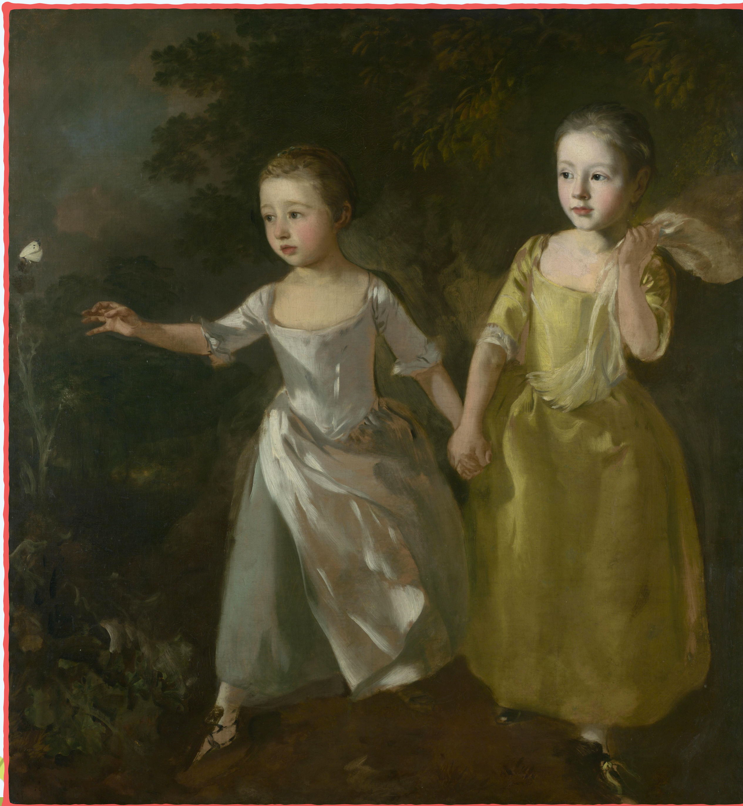
Gainsborough's Daughters Chasing a Butterfly by Thomas Gainsborough 1756