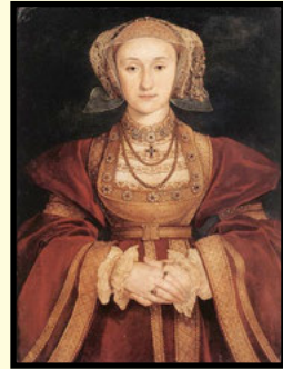
Anne of Cleves