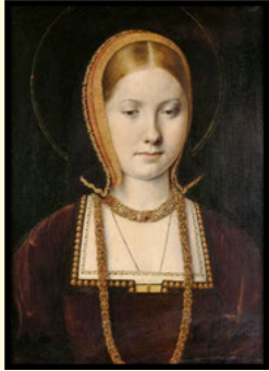
Catherine of Aragon