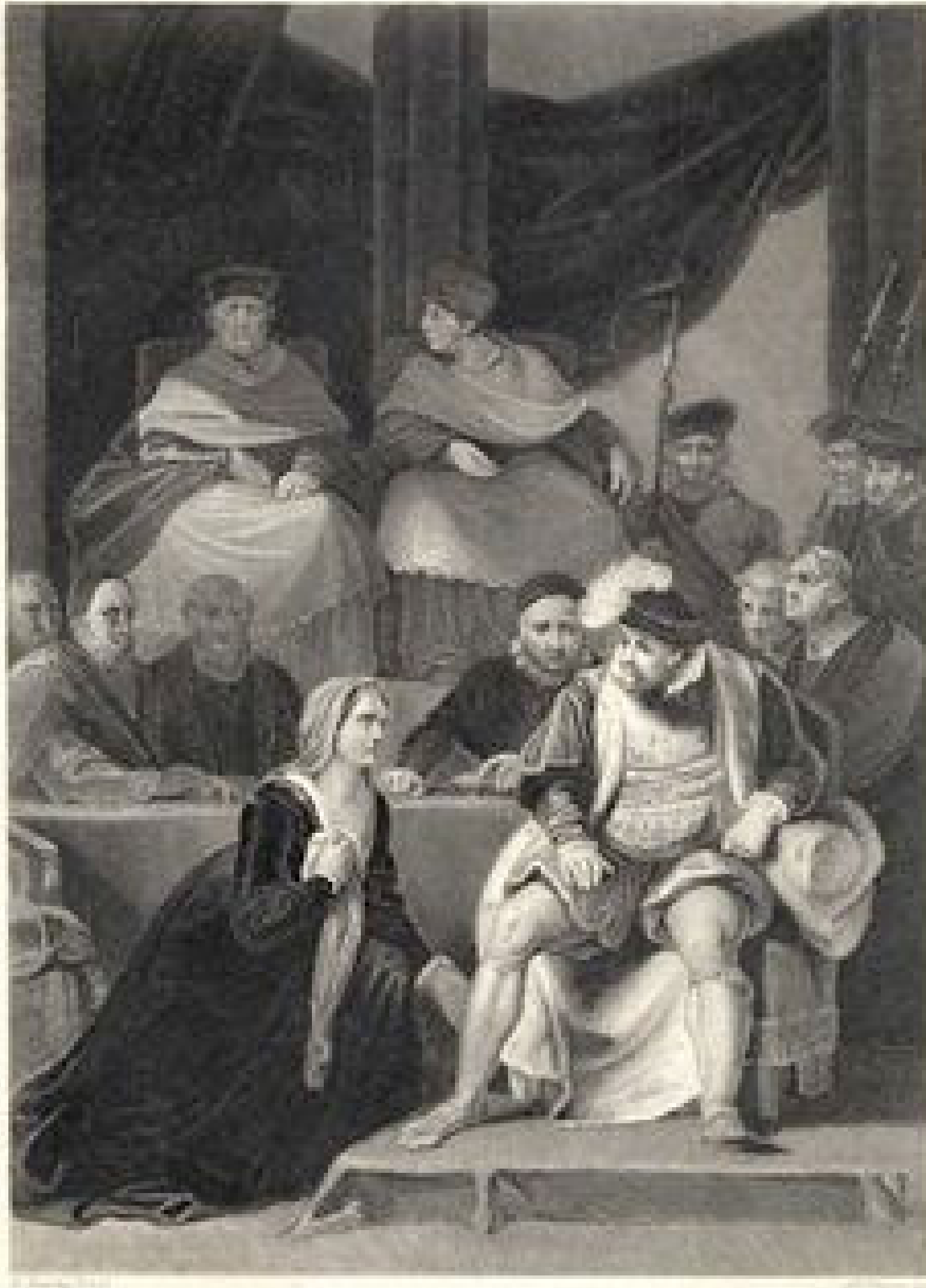
Catherine of Aragon at her first trial

Henry tried to get a divorce granted from the Pope, the head of the Catholic church. When the Pope refused, Henry split from the Catholic church and started the Church of England. This now meant Henry was free to act as he wished. A divorce trial was started but Catherine refused to co-operate. She did not want to divorce Henry.