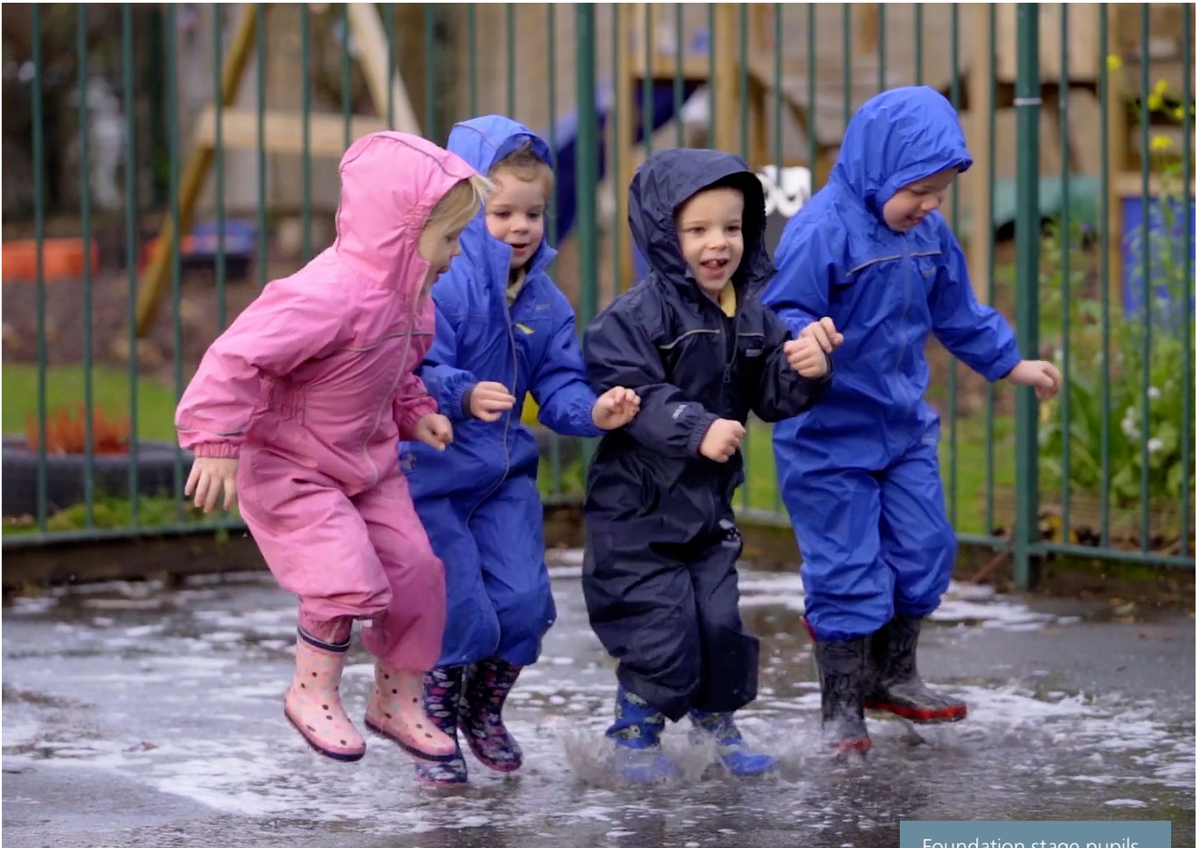
Foundation stage pupils embracing the outdoors

Most importantly, the children enjoy their learning process. As well as being equipped with the skills they need to succeed later in life, they are able to take part in a range of opportunities that allow them to reflect on their successes and celebrate their learning. Throughout the year, our pupils are involved in productions; perform in themed concerts; participate in fun, innovative whole-school challenges and competitions; and all children and staff participate in an annual, whole-school music video as part of our Celebration of Kindness week. In the past year alone, we have celebrated high attainment results and even had appearances on national television.